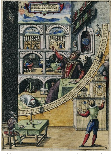
Illustration 2: Brahe and assistants at Uraniborg.

Brahe spent the next twenty years at Uraniborg making observations that were more precise and detailed than any that had ever been done before.