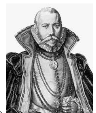
Illustration 1: Tycho Brahe