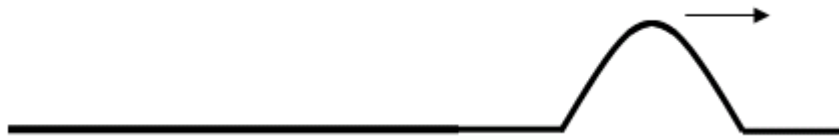
Illustration 5: ...transmits to the other, slightly lighter, rope.