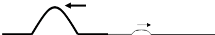
Illustration 3: ... mostly reflects back into the heavy rope.