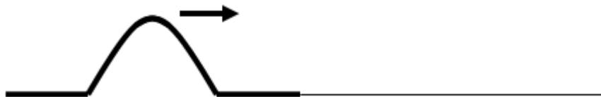
Illustration 2: Incident wave traveling in a heavy rope...