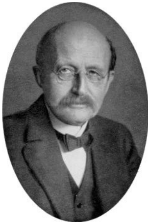
Illustration 2: Max Planck