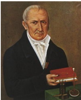
Figure 1: Alessandro Volta

The work of Galvani (and other scientists after him) in "animal electricity" was partially the inspiration for Mary Shelley's book "The Modern Prometheus", better known simply as "Frankenstein." You can read the book by clicking here or here .