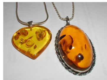
Amber Pendants